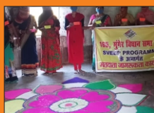
SVEEP activities across state