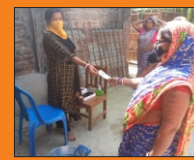
A Saviour for many