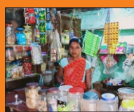
Poonam's Mini Market