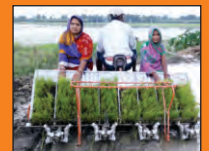
Group Farming Changing Lives