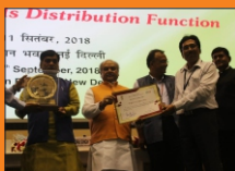
National Awards Distribution Ceremony