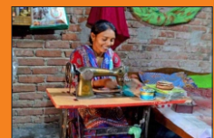
Don't stop till you reach the top