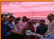
Aajeevika Grameen Express Yojana