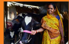
From being Hungry to Launching a Dairy